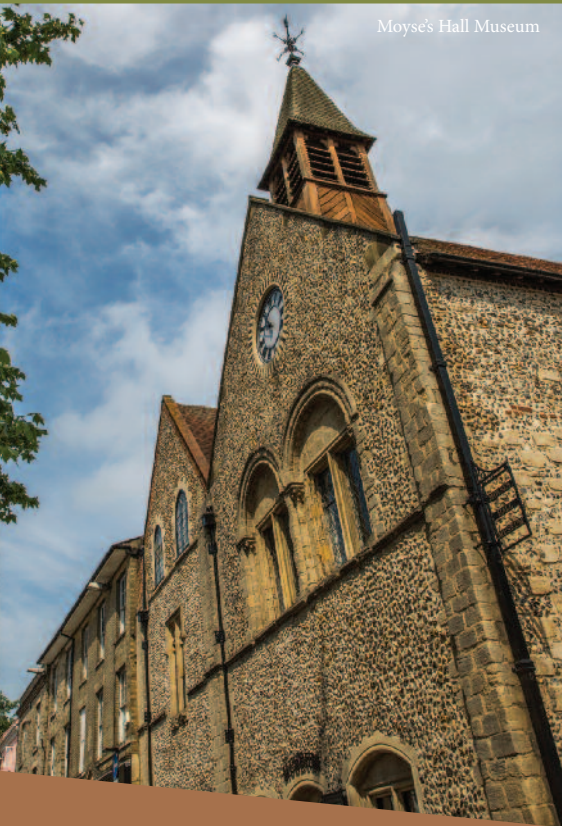
Moyse's Hall Museum