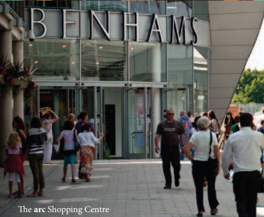
The arc Shopping Centre

This beautiful museum is housed in one of the last surviving Norman houses in Britain and offers a fascinating view into the past. Find out about the creation and dissolution of the Abbey of St Edmund, Bury St Edmunds prison, the notorious Red Barn Murder, plus fascinating insights into local superstitions and witchcraft. It has a gallery dedicated to the Suffolk Regiment and a world class collection of clocks and timepieces from Frederic Gershom-Parkington plus fine art.