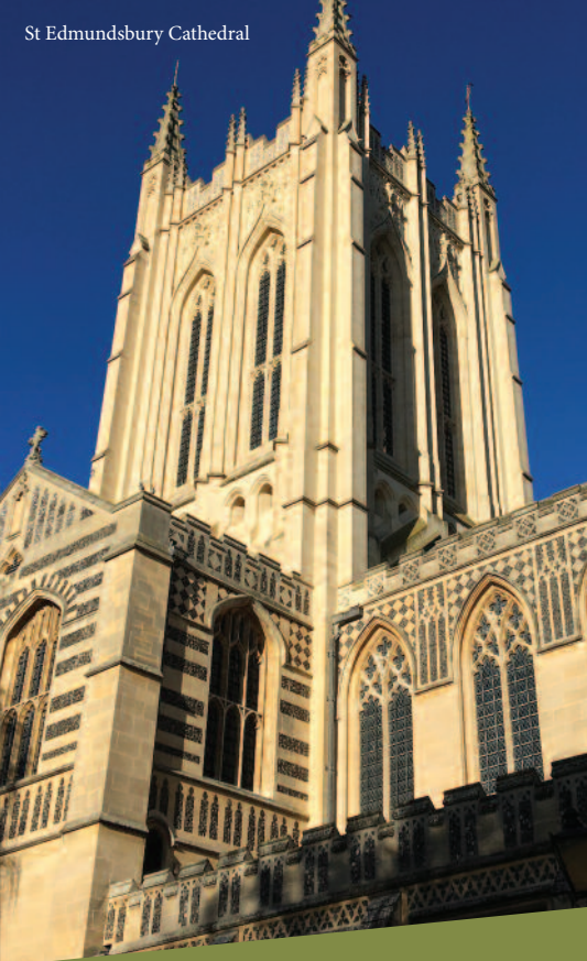
St Edmundsbury Cathedral