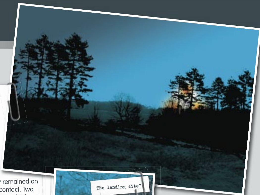
The landing site?

The first sightings from the air base had been of lights in the sky – a strange glow. As the men entered the forest, radio contact with the air base began to break down and so one of the search party remained on the edge of the forest to keep contact. Two men therefore continued deep into the forest until they approached the eastern edge. It was here they reported seeing a shape in a clearing! Walk on to Point 3 on the map