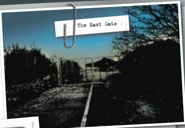
The East Gate